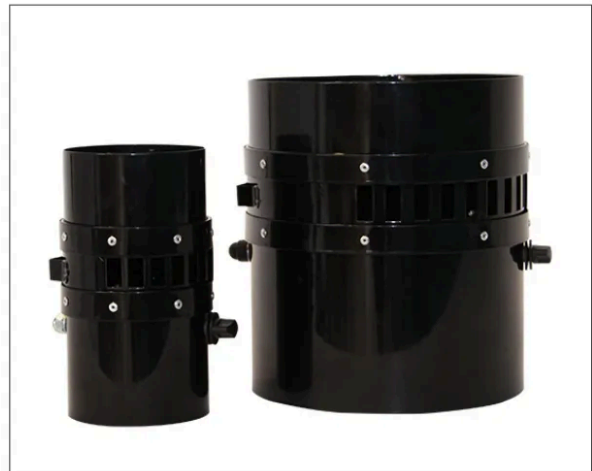
Smart Cool SC