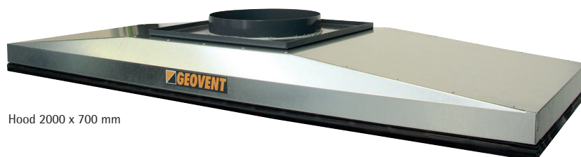
Hood 2000 x 700 mm