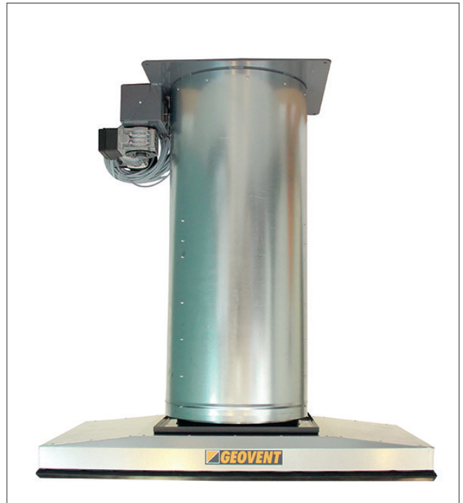
Hood 2000 x 700 mm