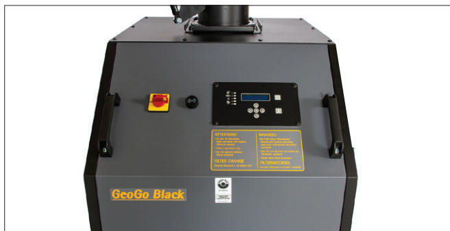
GeoGo Black W3