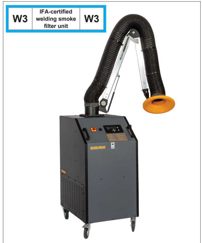
GeoGo Black W3